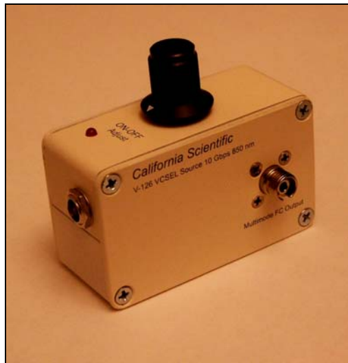
V-126 Enclosure Dimensions are: 1.1" X 1.5" X 2.5"